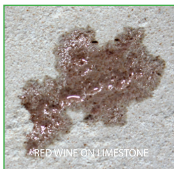
*RED WINE ON LIMESTONE