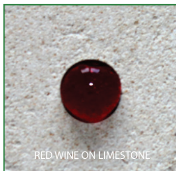
RED WINE ON LIMESTONE

Spills penetrate deep into the pores of an untreated surface leaving hard to remove or permanent staining.