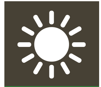
STEP 4 DRY