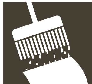
STEP 3 SATURATE