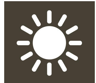
STEP 4 DRY